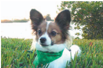
Genevieve, our canine columnist