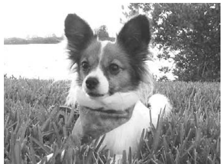
Genevieve, our canine columnist

— Kibbles and Kisses, Genevieve Eiffel Press, Publisher of the pet classic "Memoirs of a Papillon: The Canine Guide to Living with Humans without Going Mad"; and "A Tongue in the Sink: The Harrowing Adventures of a Baby Boomer Childhood." Call 941-918-0411 or go to www.dogtellsall.com